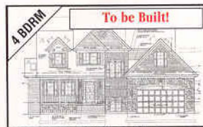
To be Built

Deep gorgeous private lot * Lovely landscaping * Elevated Deck * Wide concrete drive * Formal front rooms * Upgraded eat-in KIT * 1st floor LDY * Remodeled MSTR Suite w/luxury bath * Fin. BMST w/2nd KIT 1-800-478-1601 Code 2389 $599,900