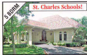
St. Charles Schools!

INCREDIBLE DESIGN! * Fabulous private cul-de-sac lot! * 9-foot ceilings * Extensive wood trim * Brick & stone detailing w/a Porch * Elevated Lower Level * 2nd floor Media/Computer/Pool Room 1-800-478-1601 Code 2338 $874,900