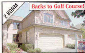
Backs to Golf Course!

BRAND NEW PREMIUM LOCATION END UNIT * Plenty of upgrades * 2-story entry * Living Room w/fireplace & private balcony * Eat-in KIT w/island, all appliances & access to Deck * 1st floor MSTR Suite *BSMT ready to finish 1-800-478-1601 Code 2398 $374,900