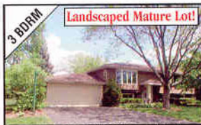
Landscaped Mature Lot!

ADJACENT TO CREEKSIDE PARK * Walking paths * Music Gazebo * Beautiful Landscaping * Walk to town, train, DuPage hospital & more * Build your dream home here! * Adjacent parcel is also available * Call for all details! 1-800-478-1601 Code 2347 $299,900